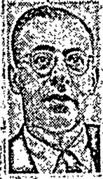
—Alinsky "Trainees will learn the art of sit-ins."

organized middle class. They make up three-fourths of our population, but